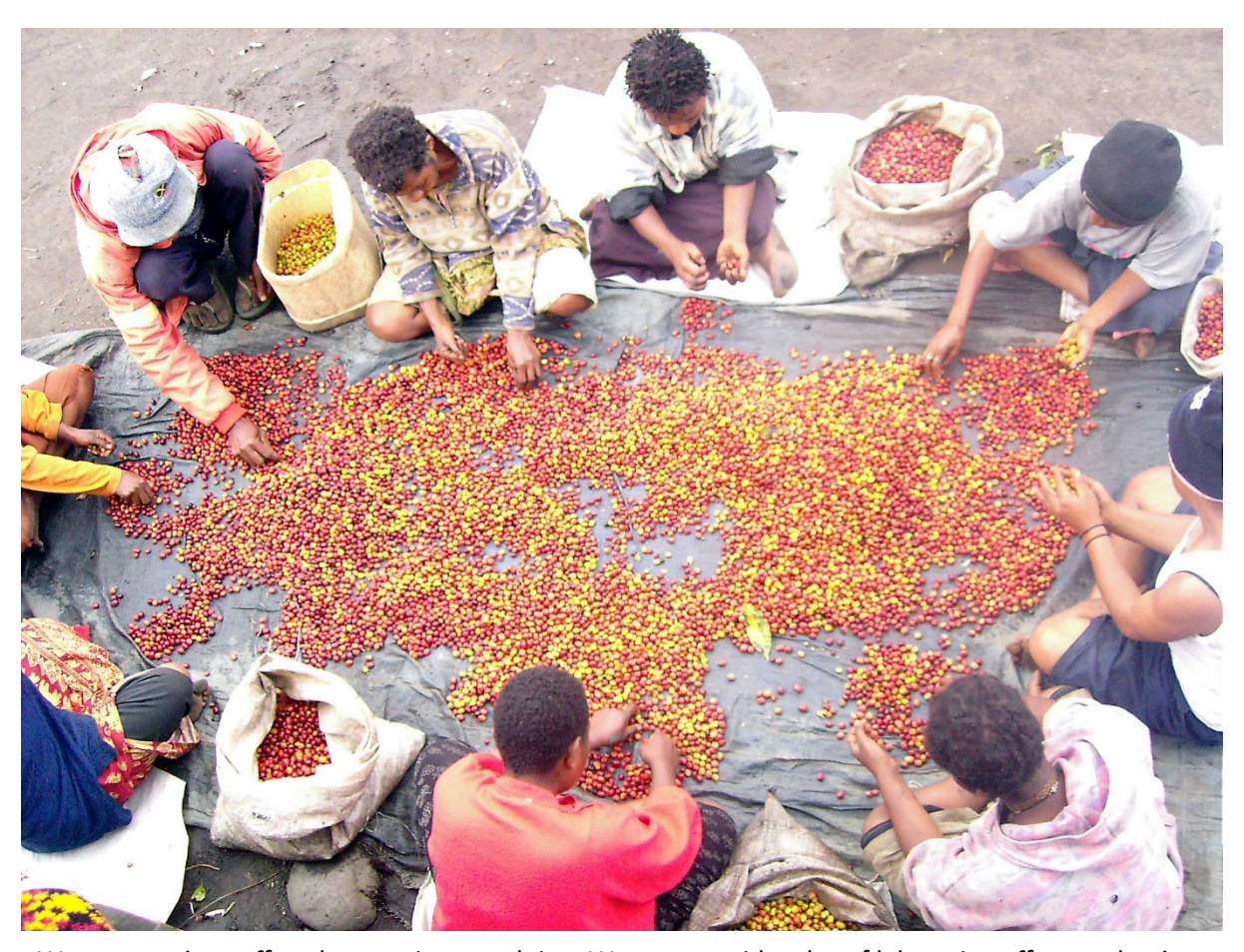
Women sorting coffee cherry prior to pulping. Women provide a lot of labour in coffee production, particularly for harvesting and processing which are the periods of high labour demand.