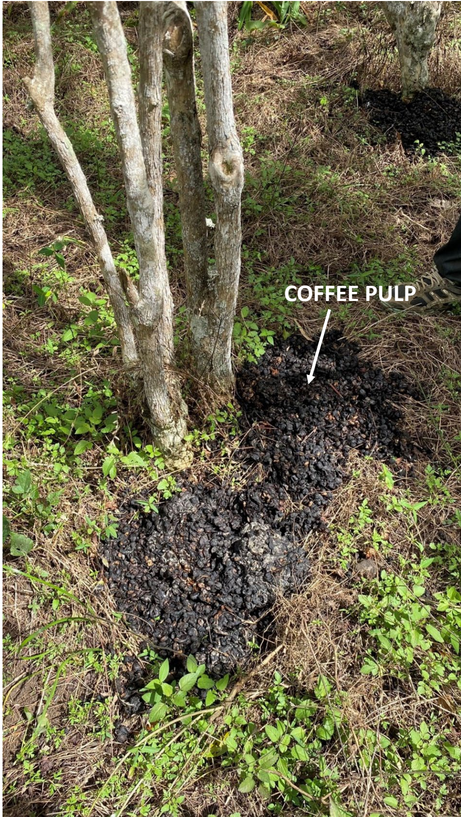
Coffee pulp spread around a coffee tree.